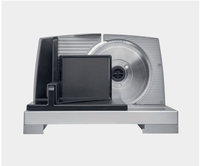
230 V, 65 W, duty cycle 5 min, VDE/GS, protection class 2, CE