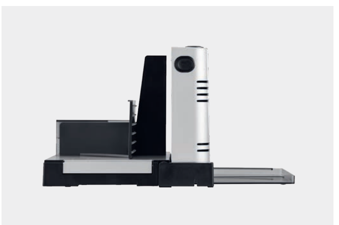
230 V, 65 W, duty cycle 5 min, VDE/GS, protection class 2, CE