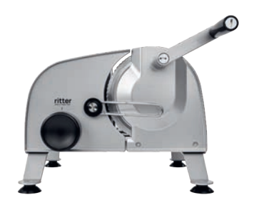
podio<sup>3</sup> Page 54/55