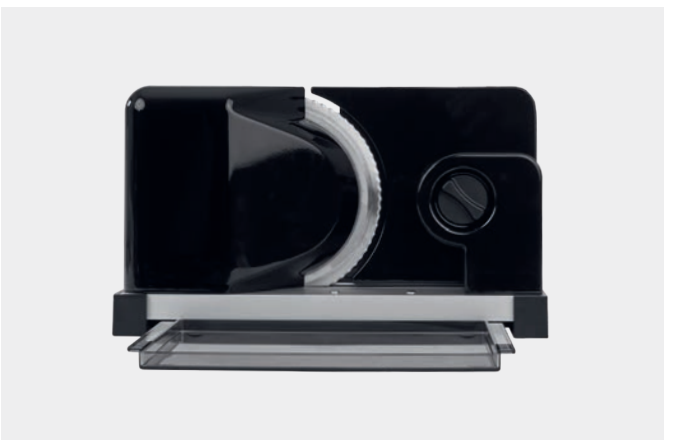
230 V, 65 W, duty cycle 5 min, VDE/GS, protection class 2, CE