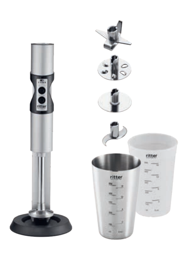
Hand blender vertico<sup>7</sup> Plus Page 12/13