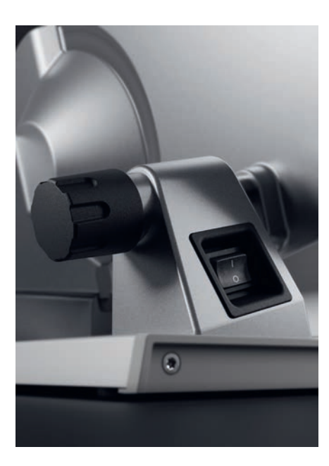
Fine adjustment of cutting thickness