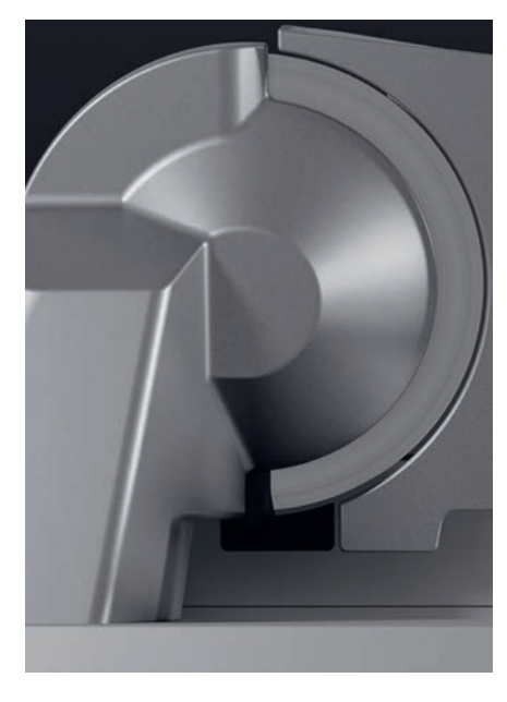
Unique motor head