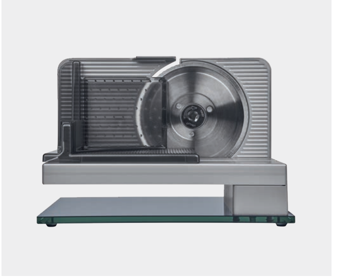
230 V, 65 W, duty cycle 5 min, VDE/GS, protection class 2, CE