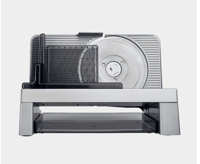
230 V, 65 W, duty cycle 5 min, VDE/GS, protection class 2, CE