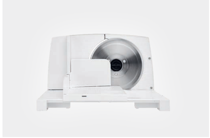
230-240 V, 65 W, duty cycle 5 min, VDE/GS, protection class 2, CE