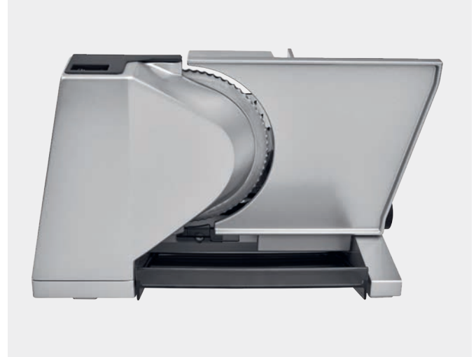
230 V, 65 W, duty cycle 5 min, VDE/GS, protection class 2, CE