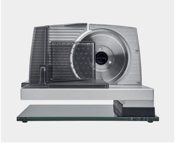
230 V, 65 W, duty cycle 5 min, VDE/GS, protection class, CE