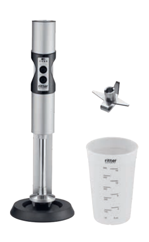
Hand blender vertico<sup>7</sup> Page 10/11