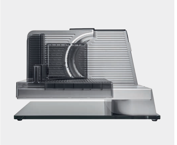
230 V, 65 W, duty cycle 5 min, VDE/GS, protection class 2, CE